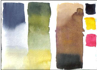
Limited palette of Cadmium Yellow, Indigo Blue, and Scarlet Red

This watercolor painting uses a limited palette of Yellow, Red and Indigo Blue.