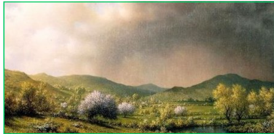
Heade- April Showers

Looking For Inspiration without having to spend a lot of "green"? Go to the Amon Carter Museum of Art in Ft. Worth Texas and visit the exhibit from the Hudson River School artists on display ...Hurry ...it ends in June..... You will go away amazed and beholden to the artists of the past who have recorded America for us forever .To learn more type in the words Hudson River School and you can see slideshows, painting tips, all the art and the artists of that group.