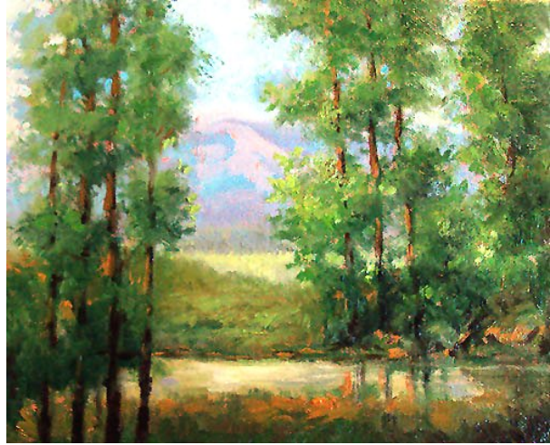
Cerulean Blue in the sky, mountains, and distant grass...PB in the foreground trees and front grass. I used a scarlet toned ground canvas before I started to paint the greens and let it dry. A toned ground will help you to see truer color than painting on a white canvas.